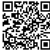
Online visitor card

Stay up-to-date with Trinity! Our weekly email newsletter delivers important announcements and information to your inbox every Friday, with additional topic-specific updates on Wednesdays. Subscribe at trinitychurchindy.org/e-news .